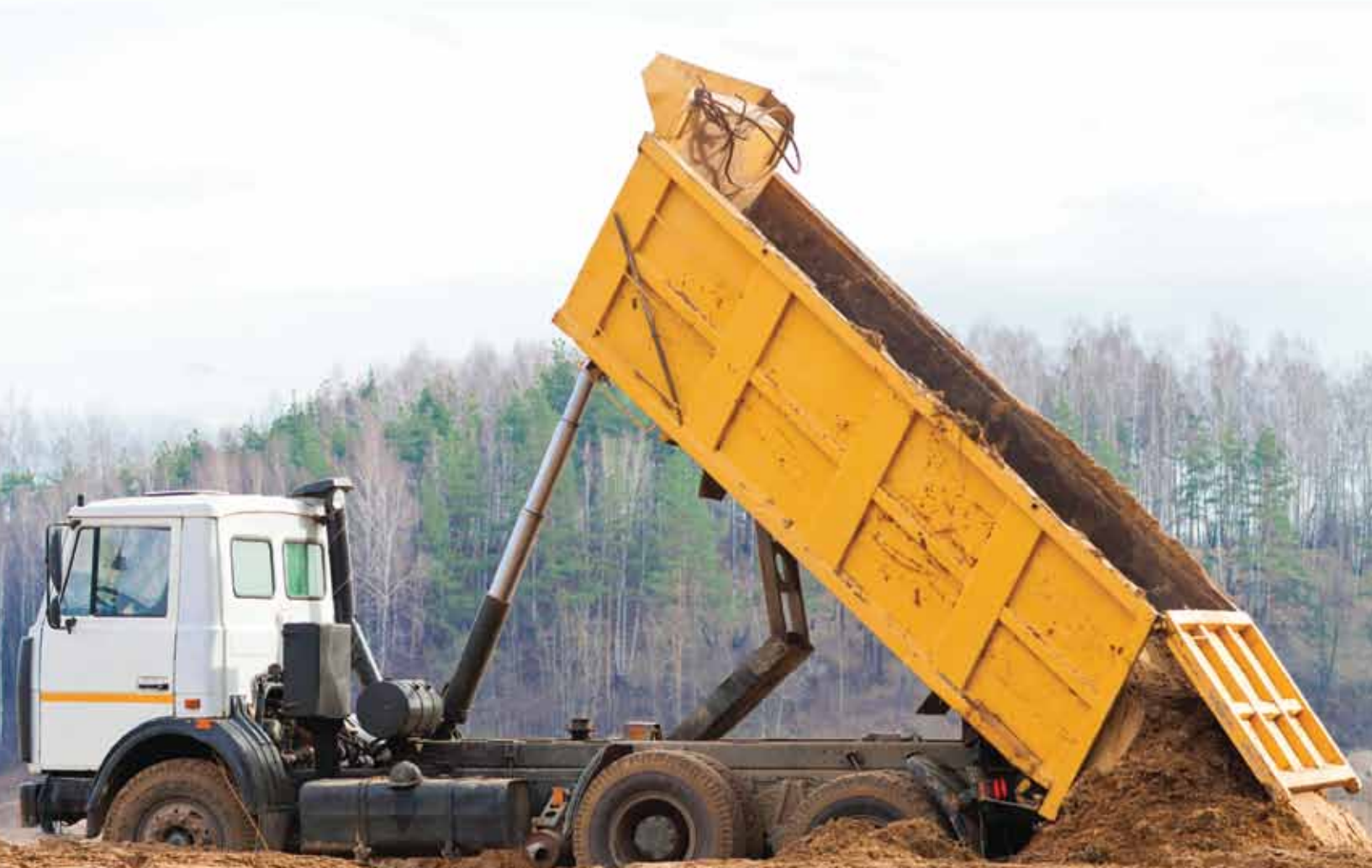
Control Valve Blocks