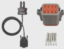
Cables & Connector Kits

Hydrotech offers a complete line of quality accessories from the best manufacturers designed specifically for your machine platform. This complete line is complimented by our custom mounting solutions.